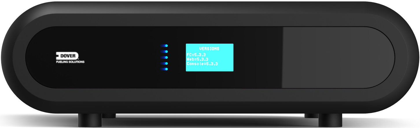
DFS Fusion™ automation server version 3